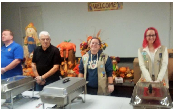
Photo from a Woonsocket Council fundraiser for New Beginnings Soup Kitchen in 2018